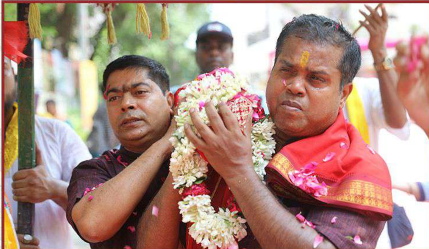
Thyagraj Nagar, Delhi