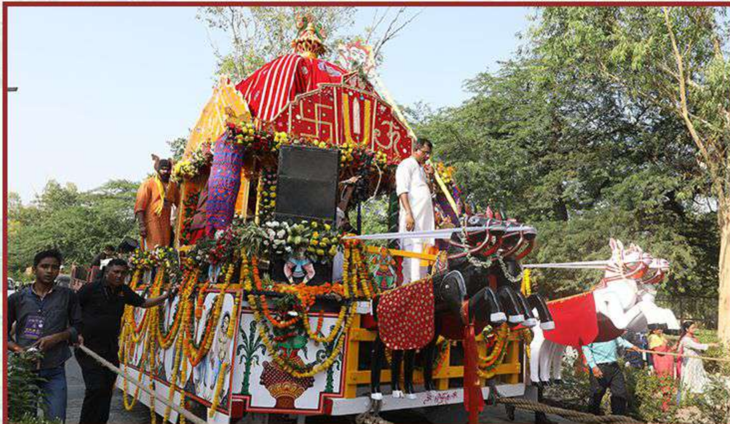
Thyagraj Nagar, Delhi