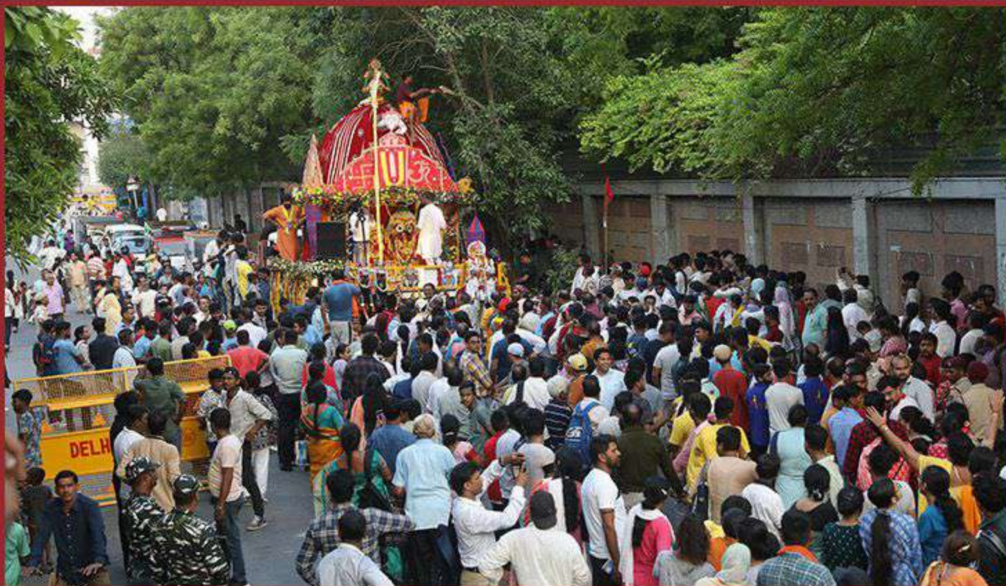
Thyagraj Nagar, Delhi