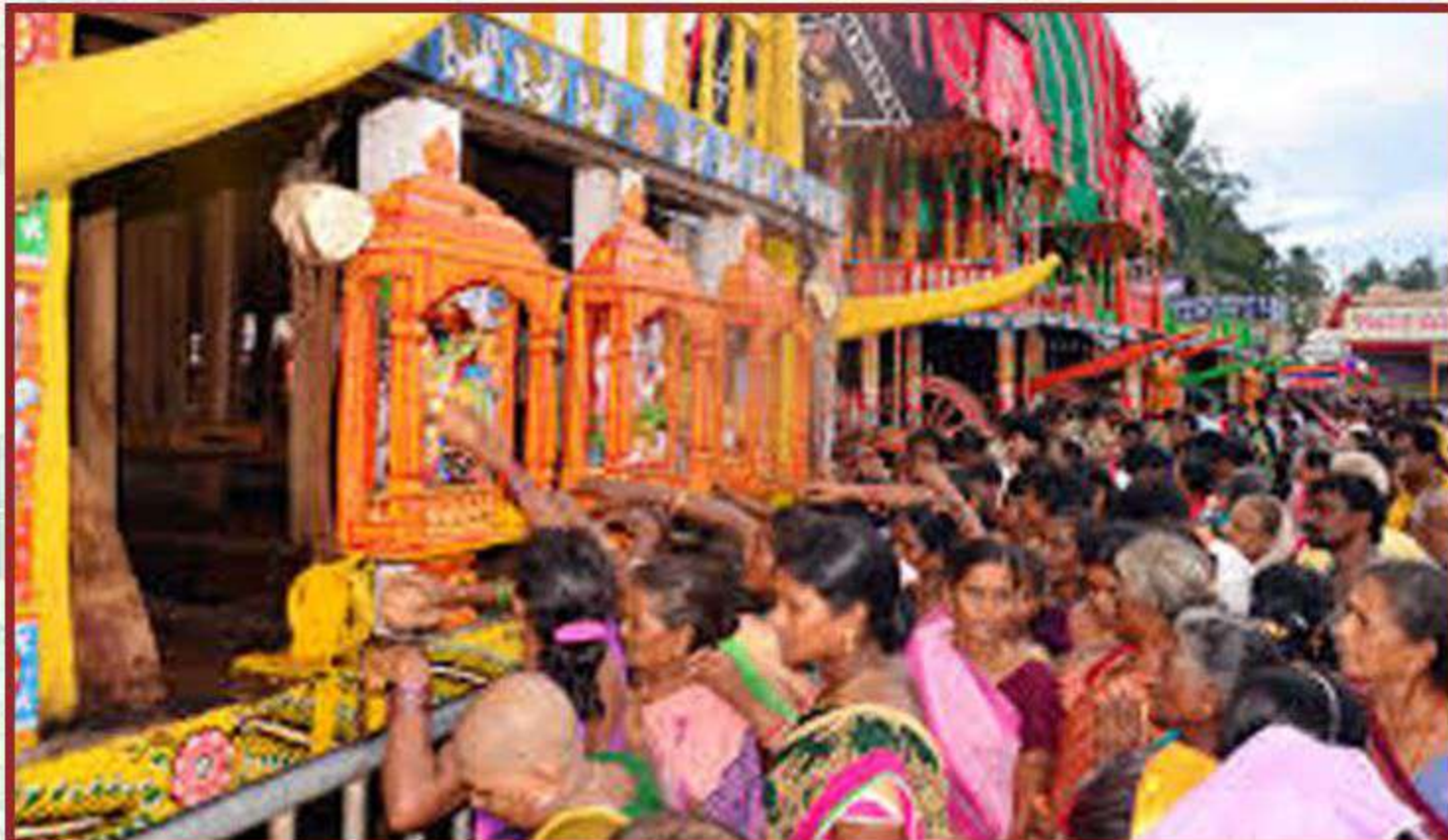
Thyagraj Nagar, Delhi