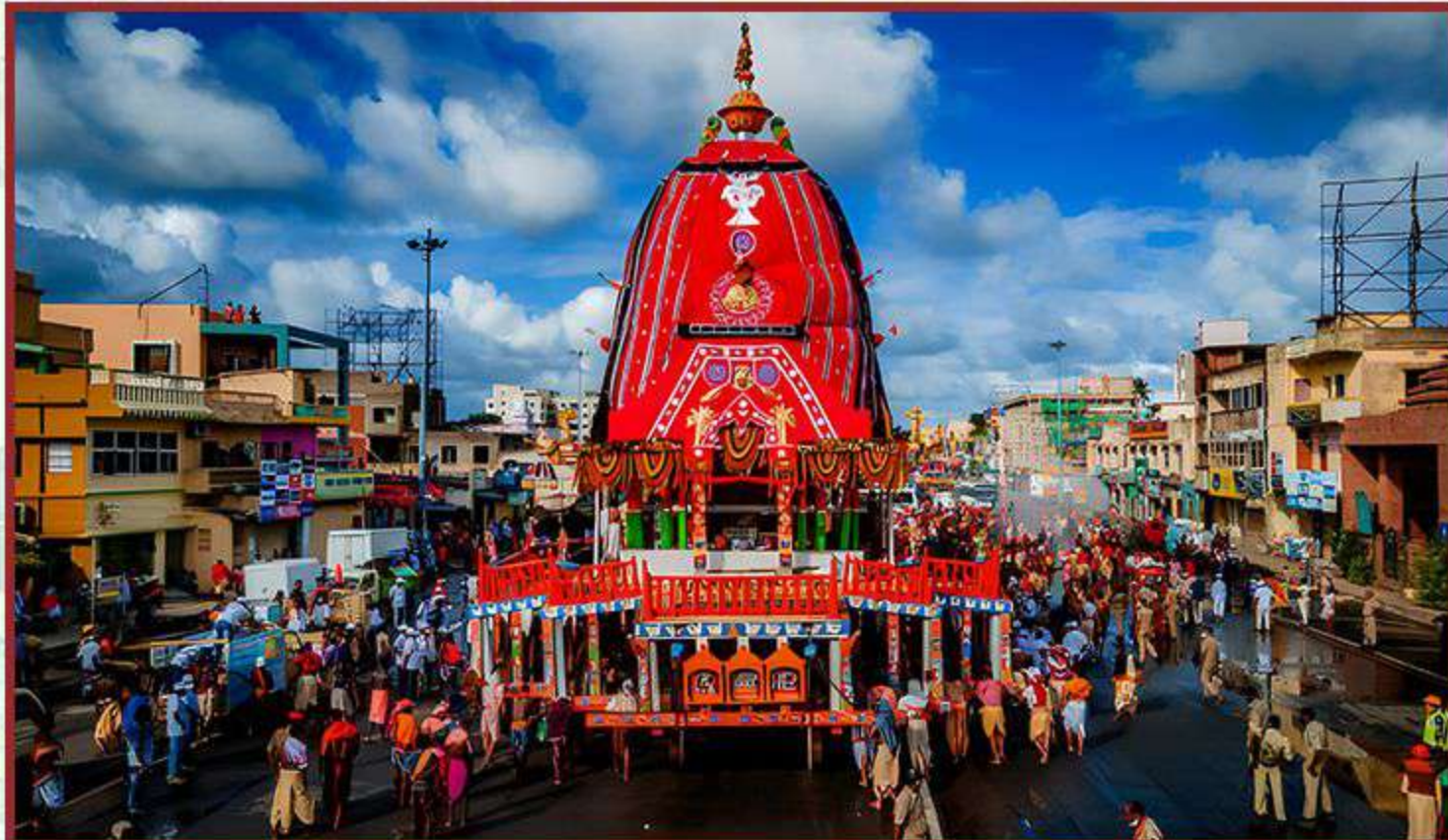
Thyagraj Nagar, Delhi