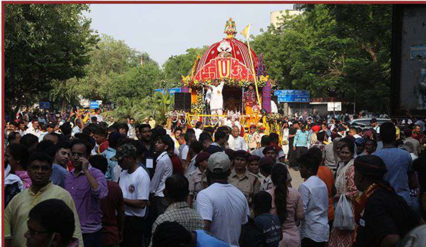
Thyagraj Nagar, Delhi