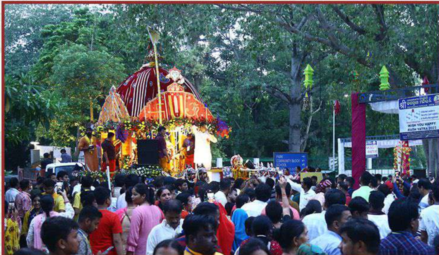
Thyagraj Nagar, Delhi